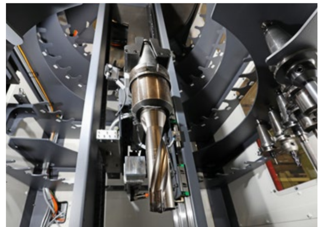
Tools always at the ready: On request, the grippers can also handle different tool mounts simultaneously.