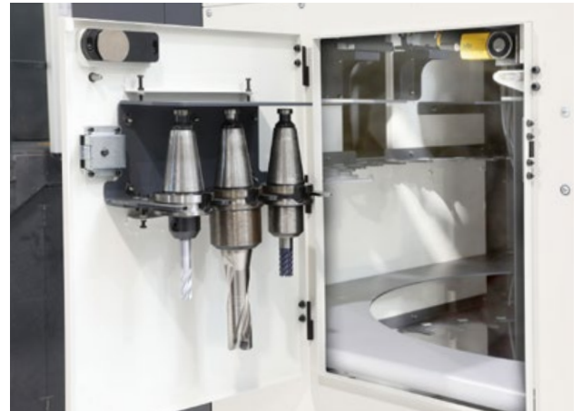
Ergonomic loading door for up to 3 tools simultaneously