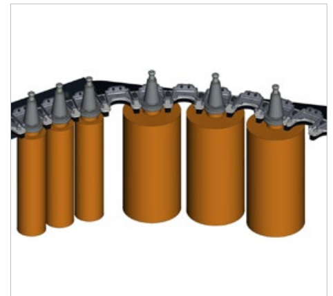
Layout for HSK100, PSC 100, SK50, BT50: Left: standard diameter up to 125 mm Right: Diameter up to 280 mm with empty adjacent slots