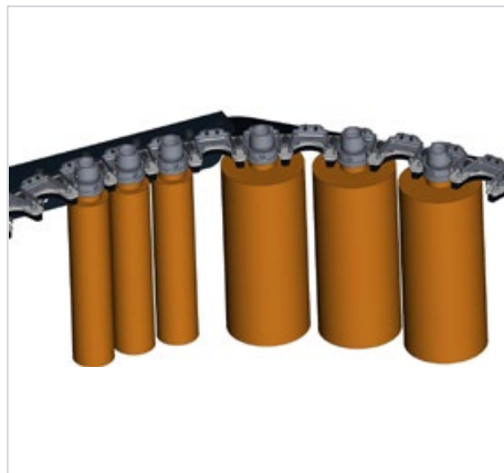
Layout for HSK63, PSC 63, SK40, BT40: Left: standard diameter up to 80 mm Right: Diameter up to 160 mm with empty adjacent slots