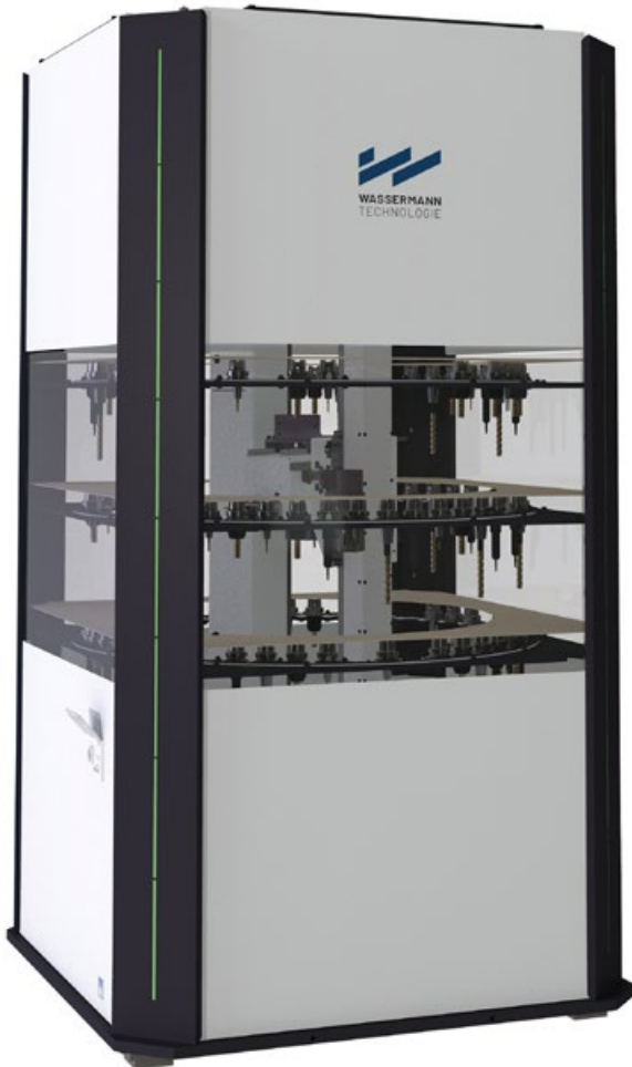
The compact tool TERMINAL for up to 350 additional tools on your machine

The compact tool TERMINAL for your machine expansion